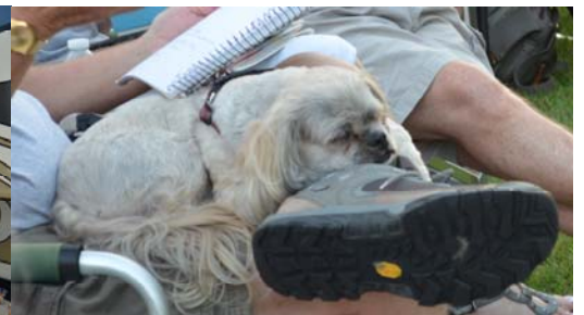
Due to noise, the meeting was moved back to our coaches