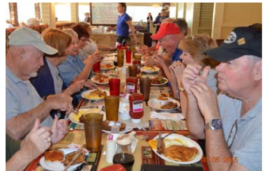
Getting warmed up and ready for lunch. Just saying!

OK I want to sit here. No you sit there. Well where do I sit! Oh just sit anywhere,